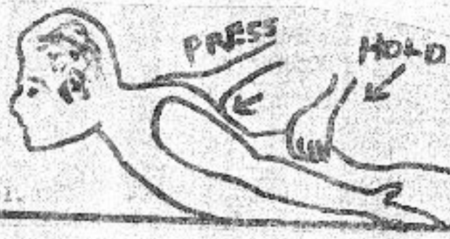
FIG. 1. Following the completion of block procedure for the Category 1, place your hand over the weak dollar sign, and the other hand over the upper dorsal spine...the patients arms should be to his side in the swimming position. Hold moderately with both hands and ask the patient to elevate head and upper trunk.

CATEGORY ONE PROCEDURE At the last Seminar I was reminded of a procedure which we used to teach at last years Seminars but we have not out lined this year. This procedure is to be found on Page 197 of the 1976 S.O.T. Notes and refers to procedures to be used following completion of Category 1 blocking procedure. It will serve a very good purpose to reproduce the information on that page especially for those who do not have the 1976 Notes.